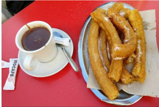
Churros con Chocolate

Churros con Chocolate is the perfect midday snack to get you from lunch to the late dinner. The chocolate is thicker than American hot chocolate and isn't meant to be drunk but to dip the churros in. The churros here aren't covered in cinnamon sugar like they are in America and instead come with a packet of sugar to sprinkle on top. Oftentimes, you can get the churros to go and they are great to eat while walking through the city or alongside the river.