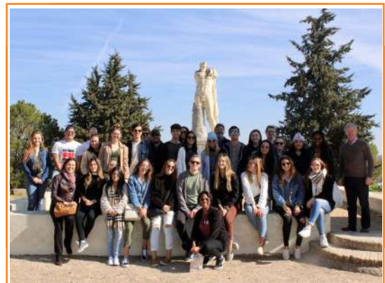
Visit to the ancient Roman city of Itálica.