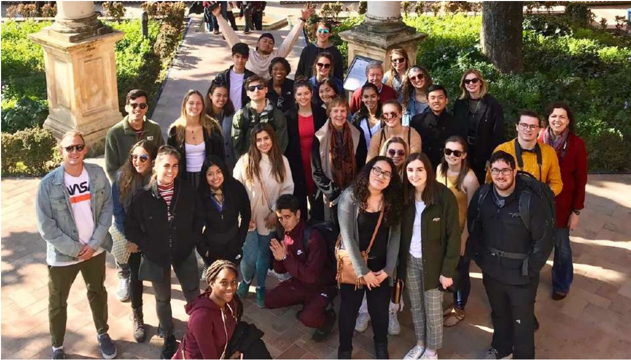
Cultural Visit to Seville's Alcázar palace.

International College of Seville Newsletter, March 2019