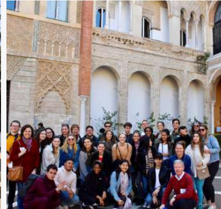
Click on pictures to see Facebook albums.