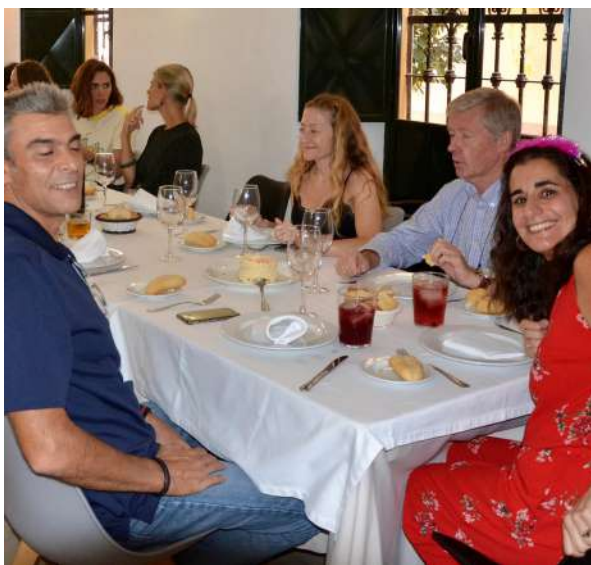
Anniversary lunch party at the restaurant Ignacio Vidal.