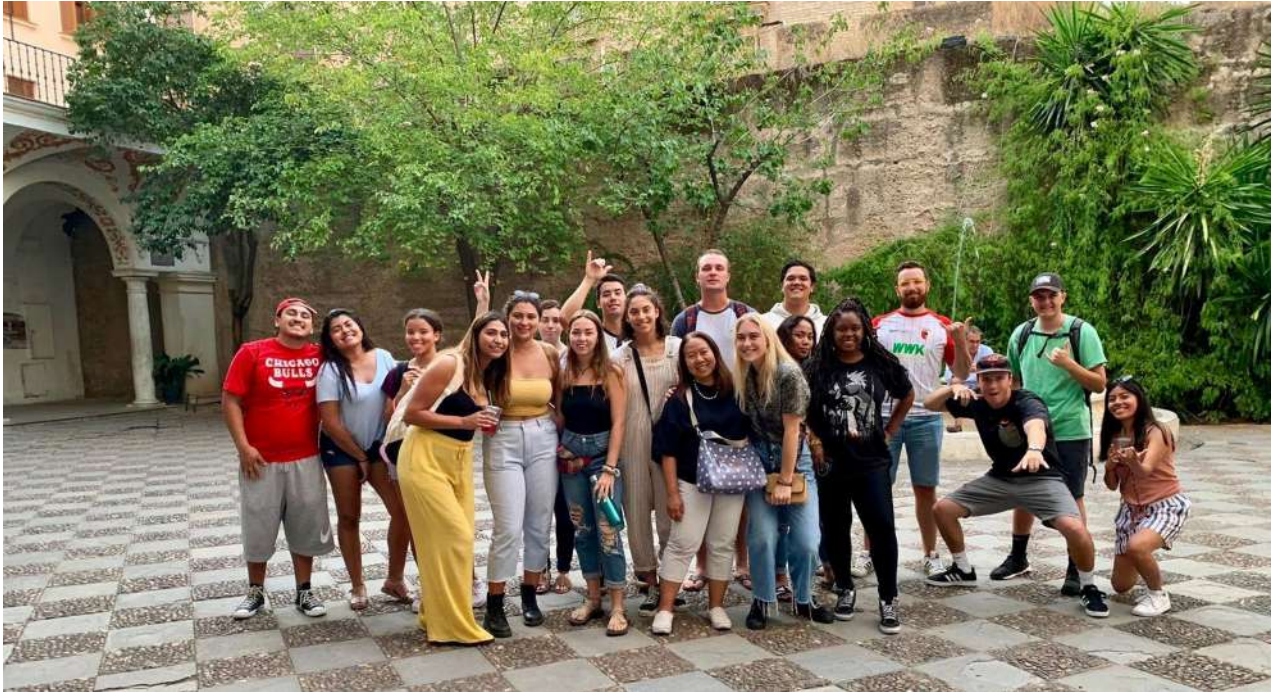
Night Tour of Seville's "Curiosities and Legends".

International College of Seville Newsletter, October 2019