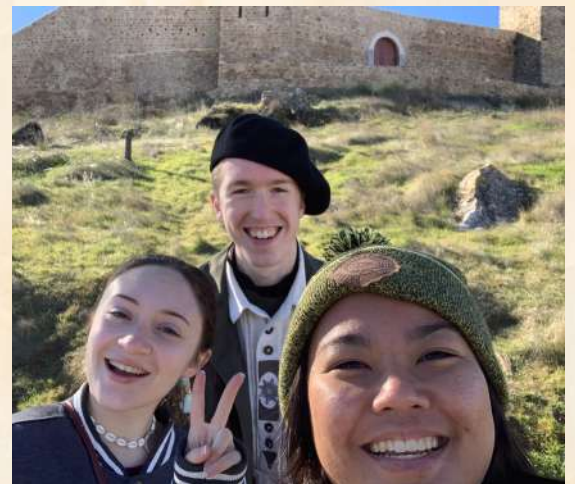
With friends in Aracena

Sitting on the steps of the Cathedral, enjoying the best gelato I've ever had in my life.