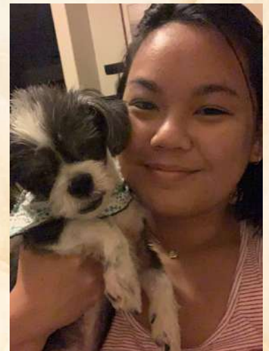
With my dog, Domino

Sitting here in Hawai’i, a world and two oceans away, Spain feels almost like a fantastical faraway land. Sometimes I wonder if I dreamed it all.