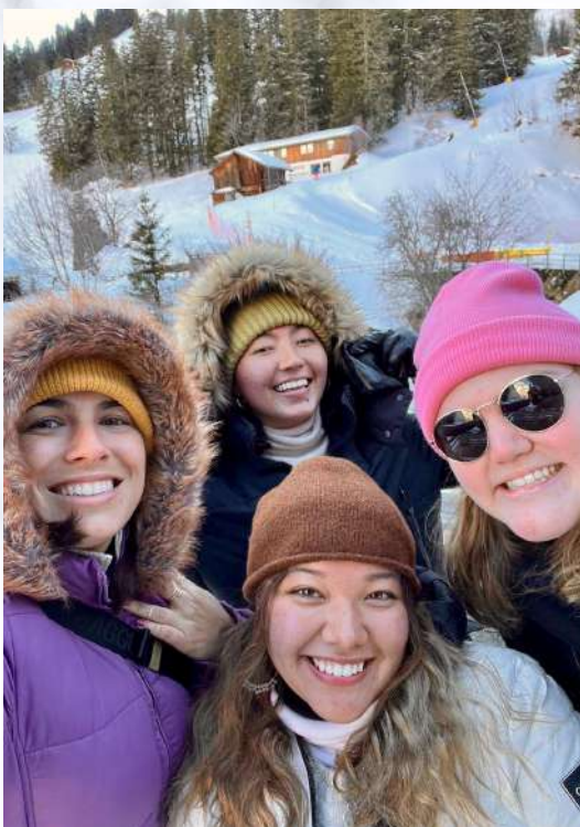
Enjoying my travels with great friends

After I came back, I realized how stepping out of my comfort zone can lead to much greatness that you wouldn't know until you are there physically. I used to be so worried about my finances because they are minimal, but I've changed my mindset.