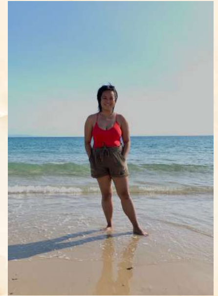
At the beach of Bolonia

A moment that is embedded in my mind forever was on a trip to the beach in Bolonia, in the very south of Spain. As someone who grew up in Hawai'i, I spent my whole life going to the beach, but this was different. I had never been so far from home, and thus, had never swum in any ocean except the Pacific. In the southernmost part of Spain, at the Strait of Gibraltar, the waters of the Atlantic begin to mix with the Mediterranean. And I realized, treading water in the sea, that I could tell. I could tell that the ocean itself felt unlike what I had known my entire life. The water was a different shade of blue-green, a different temperature, the saltiness of it even tasted different. It struck me that I was no longer back home in Hawai'i, in the waters of the Pacific.