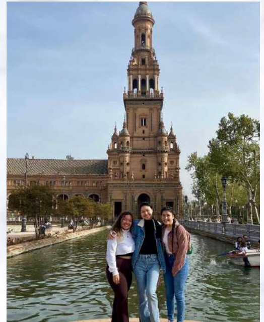
With friends in the Plaza de España

I am already halfway through our program, with only a couple of months left in this beautiful city. I still remember the day I arrived, feeling overwhelmed, having language barriers, and not being able to communicate effectively or even knowing where to go. And now, I can order food in restaurants comfortably, talk to strangers on the street, or even have daily conversations with my host mother. Through this short amount of time that I've been here, I've grown so much in so many ways. There were many problems along the way, but I could make it through, and there were always people next to me when I needed them. So much has happened within these past few months, filled with beautiful memories. Around the end of February, my friends and I traveled to Switzerland just for a couple of days, and I am so glad that I went. I never really thought about visiting Switzerland, so I thought, why not go since I would never think of going there by myself. Switzerland is one of my favorite places to visit because of the beautiful scenery and the most genuine and sweet people willing to help or care for others. Words can't express how much love I feel for that country, even though I was only there for a short period.