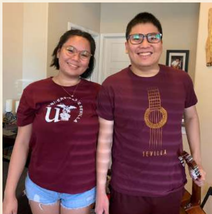
My brother and I in Sevilla shirts

Although I have returned to life here, the experiences, lessons, and memories I acquired through study abroad continue to influence the way I view myself, others, and life in general, in beautiful and sometimes unexpected ways.