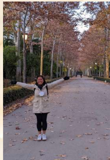
In the Maria Luisa park

When I looked out into the sea, in the distance I could see the hazy form of Morocco – another world, another culture, another life, just a stone's throw away. It was the first time, of what would later be many, that I thought to myself: Look how big the world is, and how small I am, and how lucky I am to be alive to witness it all.