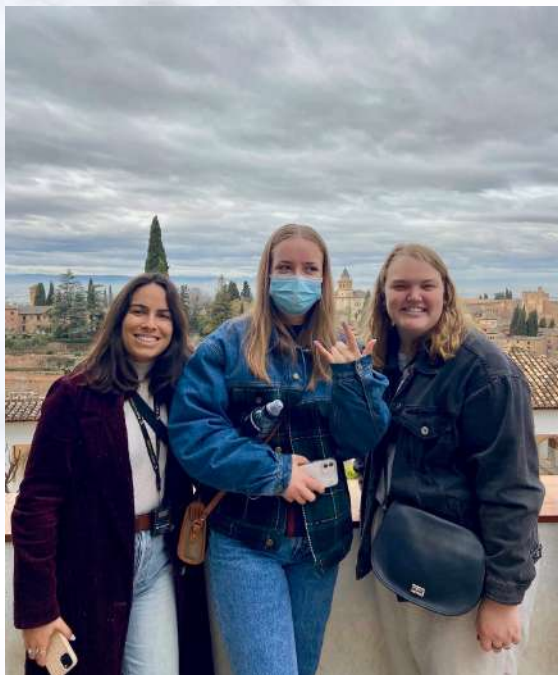
A day in Granada

I have made so many memories in these two months that I have been here, and all of them are filled with warmhearted people and unique cultures. I am nothing but grateful for the opportunities our school has provided us thus far and for the wonderful friendships that I've made here. I still have a couple more months in Sevilla, and I am excited to see what more is to come and to the adventures I will have! Little by little, I can slowly tell that I am growing by being more open-minded about life in general. Being here has been a journey that I needed to experience in order to remind myself of who I am and most importantly, who I want to be. The first step was perhaps the most important: stepping out of my comfort zone.