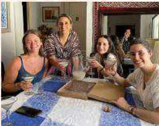
Teja meeting her host family on arrival day