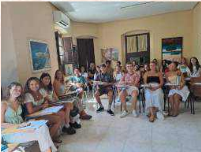
ICS Orientation day