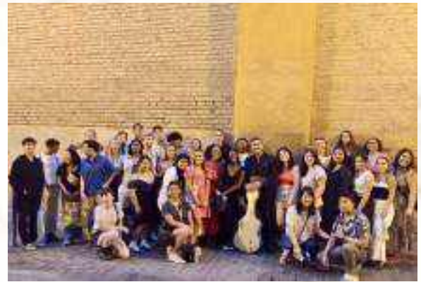
Click on photos to see FB album