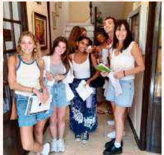
Summer students' arrival at the ICS