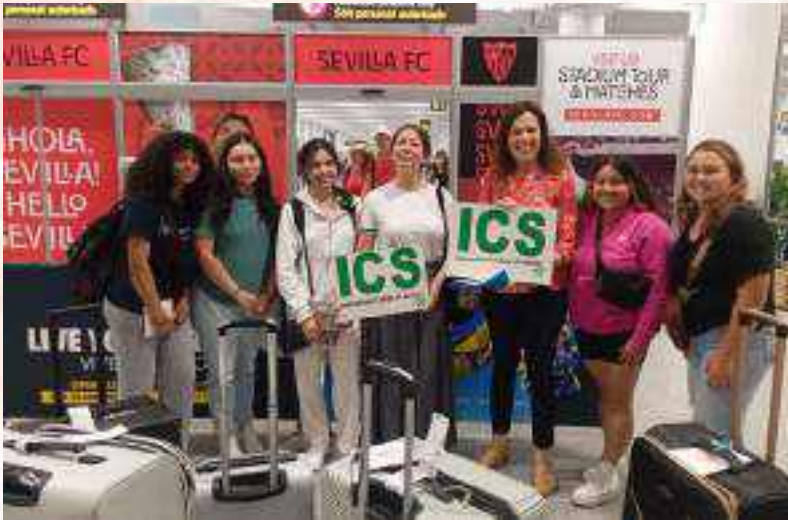
Great airport welcome reception!

On arrival day, our summer students were welcomed at the airport and greeted at the International College of Seville as they embarked on an exciting orientation that introduced them to their academic schedules, thrilling cultural immersion activities, and essential city tips, setting the stage for an unforgettable and enriching semester abroad.