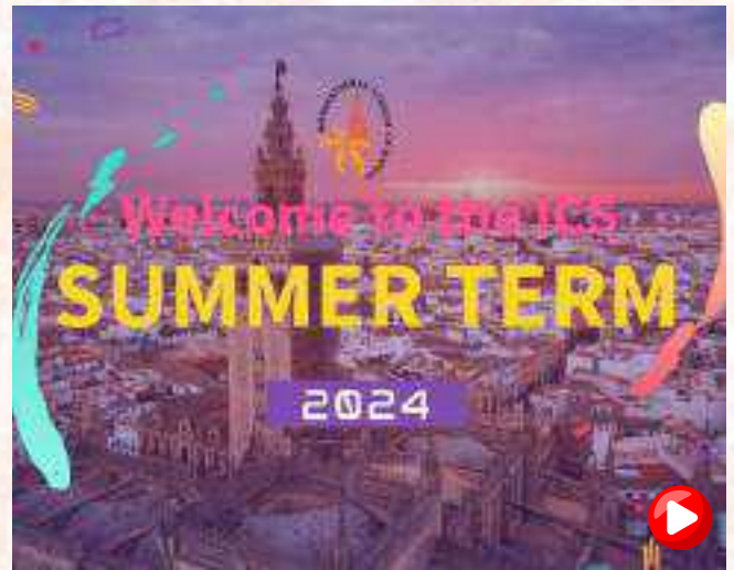
Click to see Welcome to Seville YouTube video