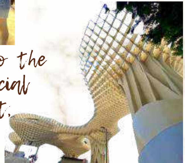
"Las Setas" monument.

Visit to the commercial district. "Las Setas"!