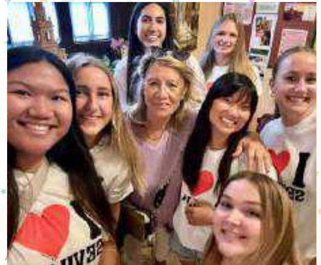
Click on pictures to see Facebook album.