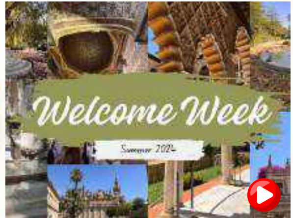
Click to see Welcome Week YouTube video.