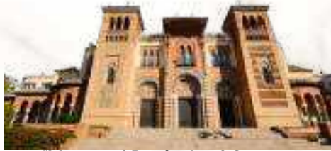
"Museum of Popular Arts & Customs."