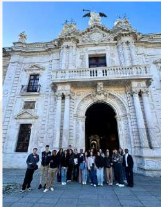
At the University of Seville