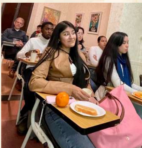
Transformative experience for all