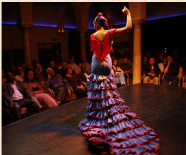
Museum of Flamenco Dance