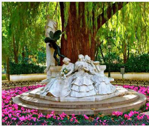
Monument to Bécquer