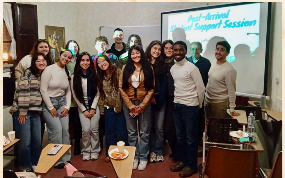
Group shot at the ICS Post-Arrival Student Reflections seminar