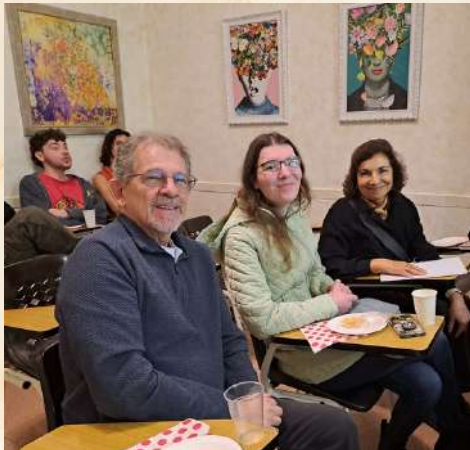
Visiting professors & students benefit from study abroad

Studying abroad is more than just an academic pursuit—it's a catalyst for personal and professional transformation. The challenges students face ultimately become opportunities for growth, shaping them into confident, open-minded, and globally competent individuals prepared for whatever comes next. We hope that prospective students will take all of these benefits into consideration the next time they are presented with the opportunity to study abroad.