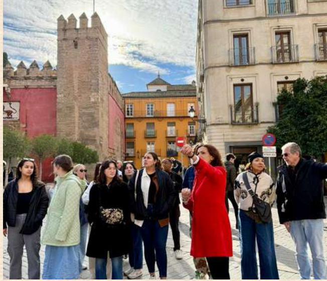
Before the Alcázar palace