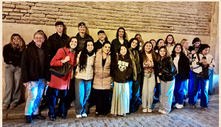
Group shot with a Flamenco singer