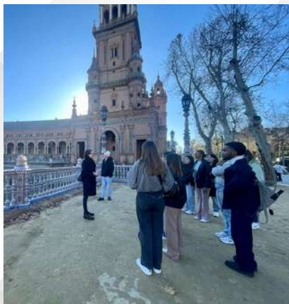
In the Plaza de España