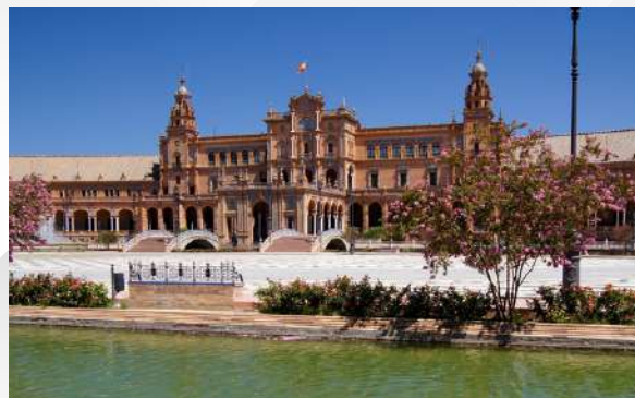
Plaza de España

Guided walks downtown, breakfast in a quaint café, churros con chocolate under the world's largest wooden structure, Seville's best-loved Flamenco show, and a cruise down the river! By the end of the week our students were not only introduced to their new city and classmates, but felt right at home!