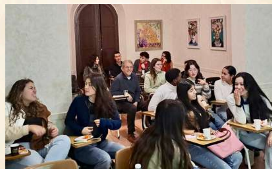
From classmates to friends

Here at the ICS, we know that studying abroad is more than just an academic experience—it's a life-changing journey that fosters personal, cultural, and professional growth. From stepping outside their comfort zones to navigating unfamiliar environments, our students emerge from their semester study abroad program with newfound confidence, adaptability, and global perspectives.