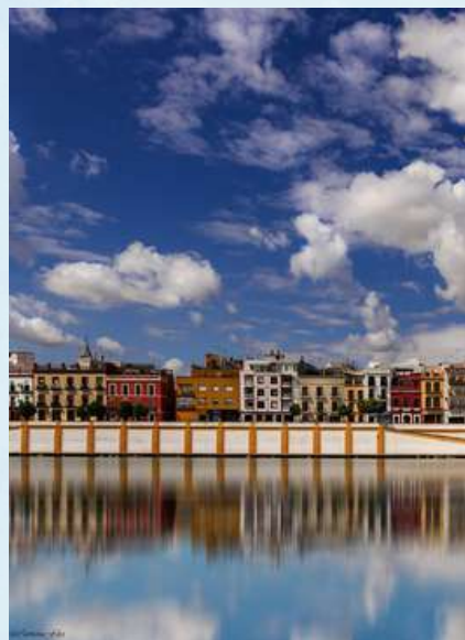
The Calle Betis