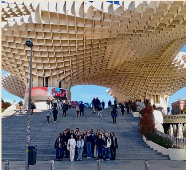
Group shot under "Las Setas"