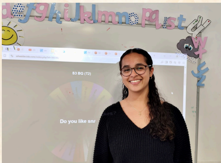
Fully enjoying my immersion!

From both of these amazing experiences, I have learned and grown in a multitude of areas. My communication skills in Spanish continue to advance as I learn new words and ways of living. While a language barrier continues to exist, having a positive attitude spans across languages. Connecting with the local community has shown me a side of Spain that I would not have been able to experience otherwise. Studying abroad has been a fantastic experience in itself, but with the immersion addition of playing on a local soccer team and interning at a language school, I have had a cultural fulfillment beyond my expectation.