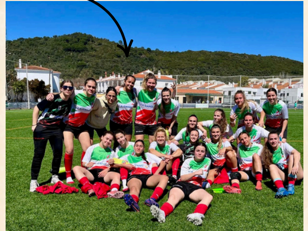
With my teammates of Azahara FC