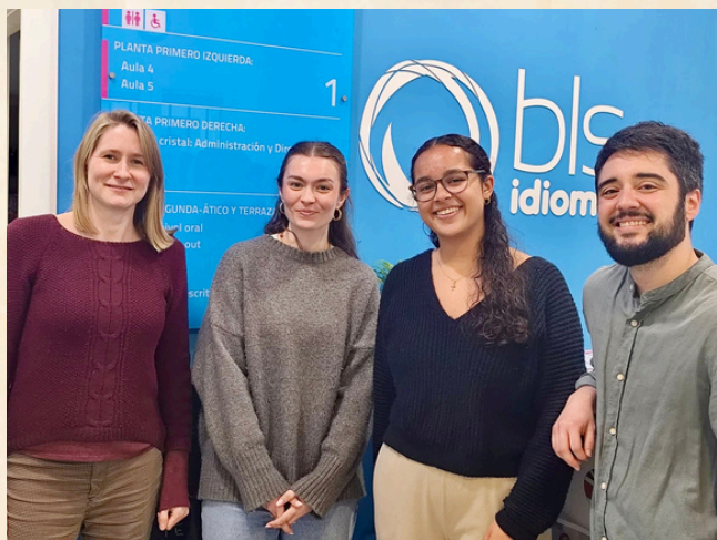
With teaching colleagues at BLS

stages of language development in each classroom which has provided me with a greater understanding of the language learning process. It has also opened up a new pathway in teaching for me that I now can consider as another possibility in my future. Ultimately, it has been such a joy collaborating with all the teachers and working with each child as they grow in their language skills each week.