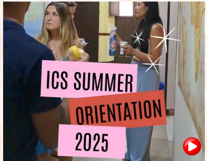
Click to see Welcome to Seville YouTube video