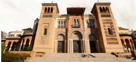
Museum of Popular Arts & Customs

For our first morning we walked through the María Luisa park, into the University of Seville and over to the Alcázar palace.