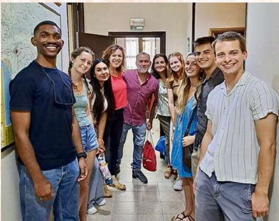
Getting to know one another