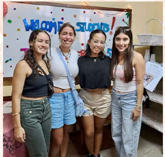
Summer welcome reception at the ICS