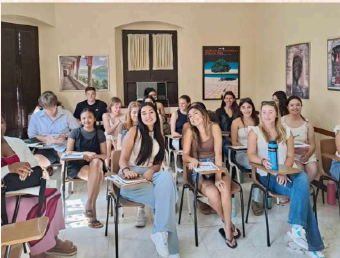
ICS Orientation day