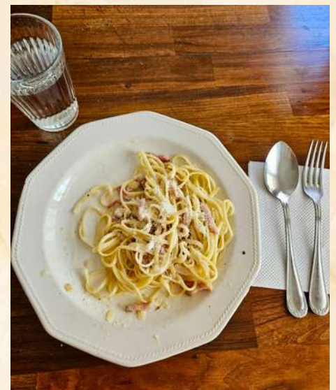
Homemade Spaghetti Carbonara.