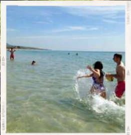
Click on pictures to see full FB album.