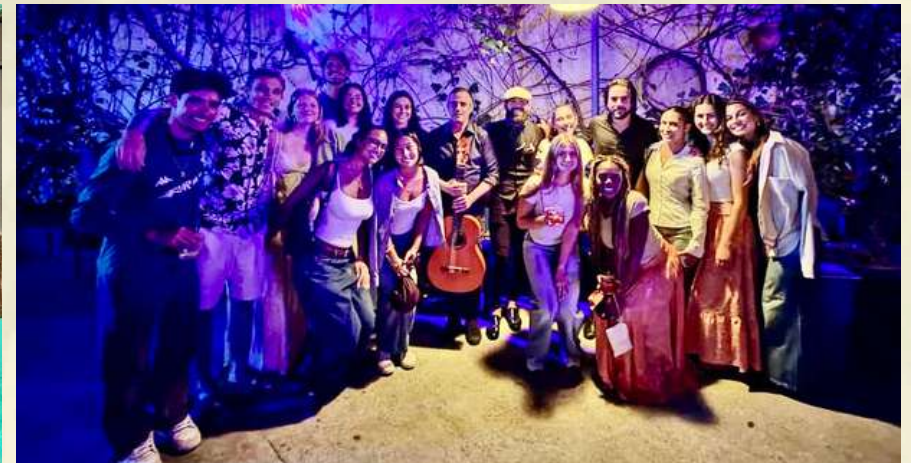
Click on pictures to see full FB album.