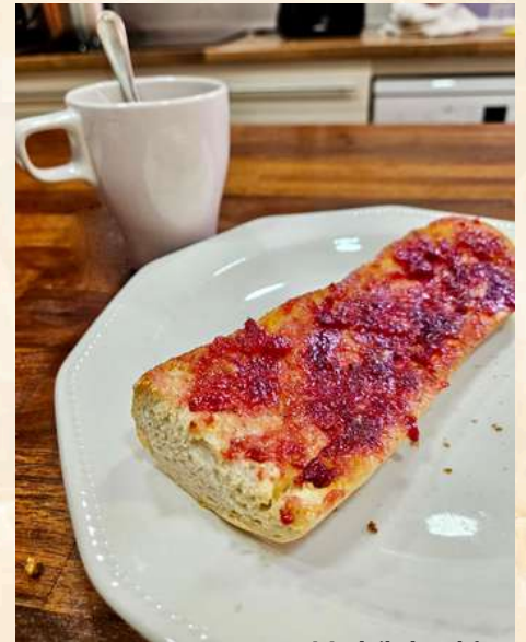
My daily breakfast.

Dinner is a lighter affair than lunch. Just last night, for example, we had a delicious Mediterranean focaccia topped with avocado, fresh vegetables, and turkey – a meal I wouldn't mind having again. Trying all the different dishes my host mom prepares has been such a fun adventure. Even when I'm unsure about something new, I remind myself of my motto: "Don't knock it until you try it!" And every time, I'm glad I did. She's made us something different every single day, and I always look forward to discovering what's next. I'm so grateful to her for sharing this part of her culture with me.