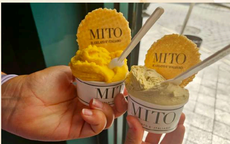
Best ice cream ever!

Of course, I can't forget to mention the amazing ice cream my classmates and I have fallen in love with. Like everything else here, it's fresh, flavorful, and simply delicious. In Seville, there's always something new to taste – and something wonderful to enjoy.