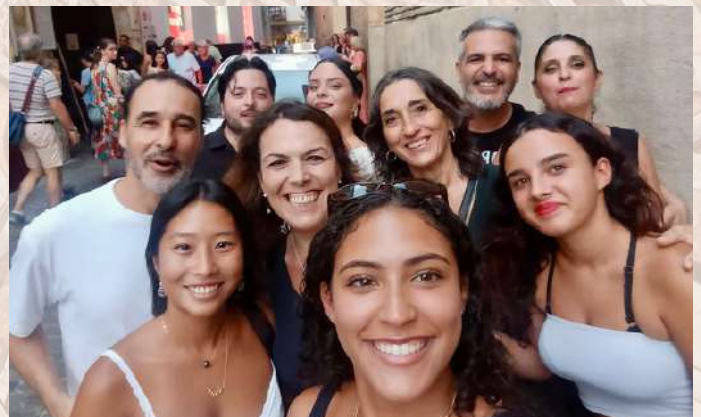
Click on pictures to see full FB album.