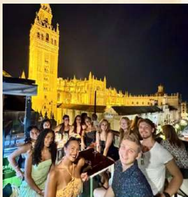
First Night Out, by Giselle WINNING PHOTO