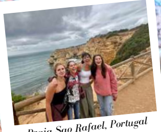
Praia Sao Rafael, Portugal