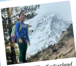
Glacier Hike, Switzerland